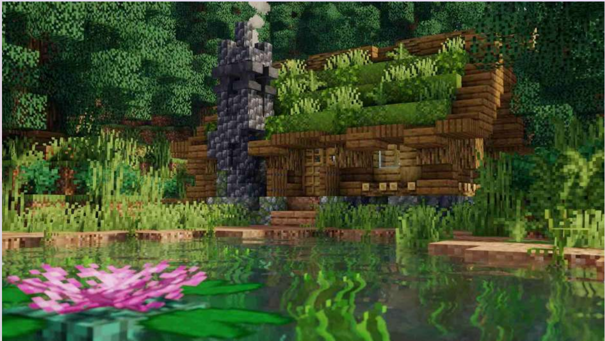
Picture 12: Encounter Replay might have been accessed somewhere around the cabin.