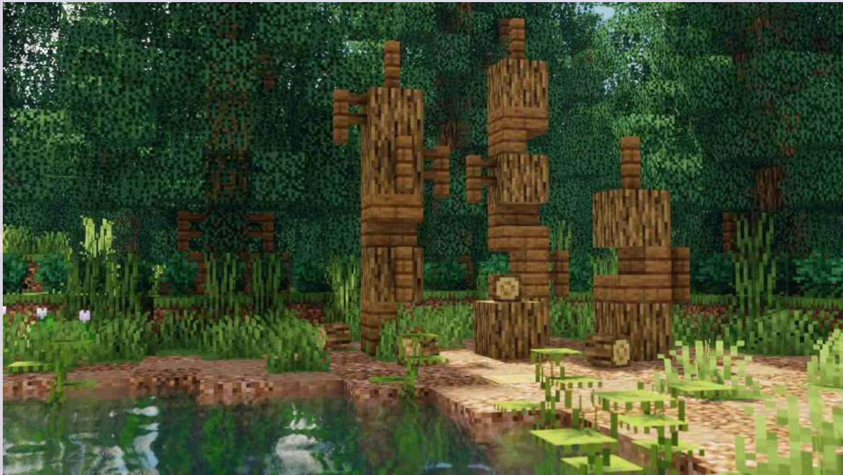
Picture 2: Leftover assets for where you would chop and find the wood in order to craft.

Luckily, removing this feature led me to the idea of the weapon upgrade mechanic, which was a far better fit for gameplay.