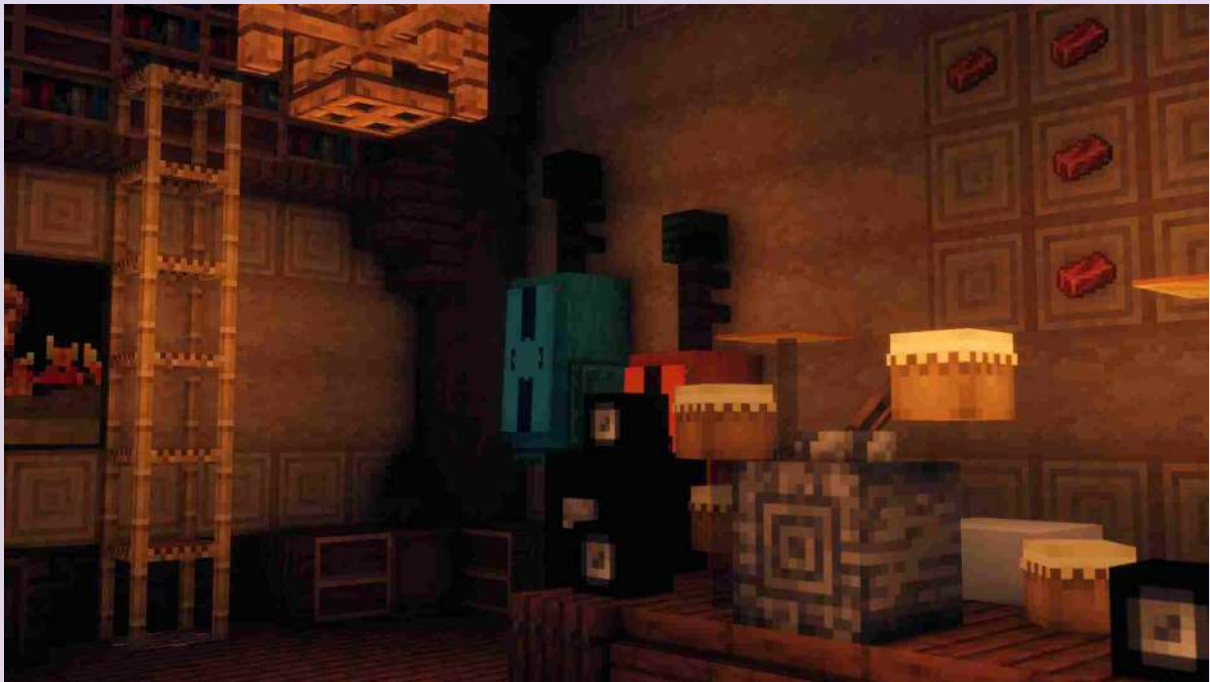
Picture 8: On the left is the scaffolding that can be avoided using the instruments.