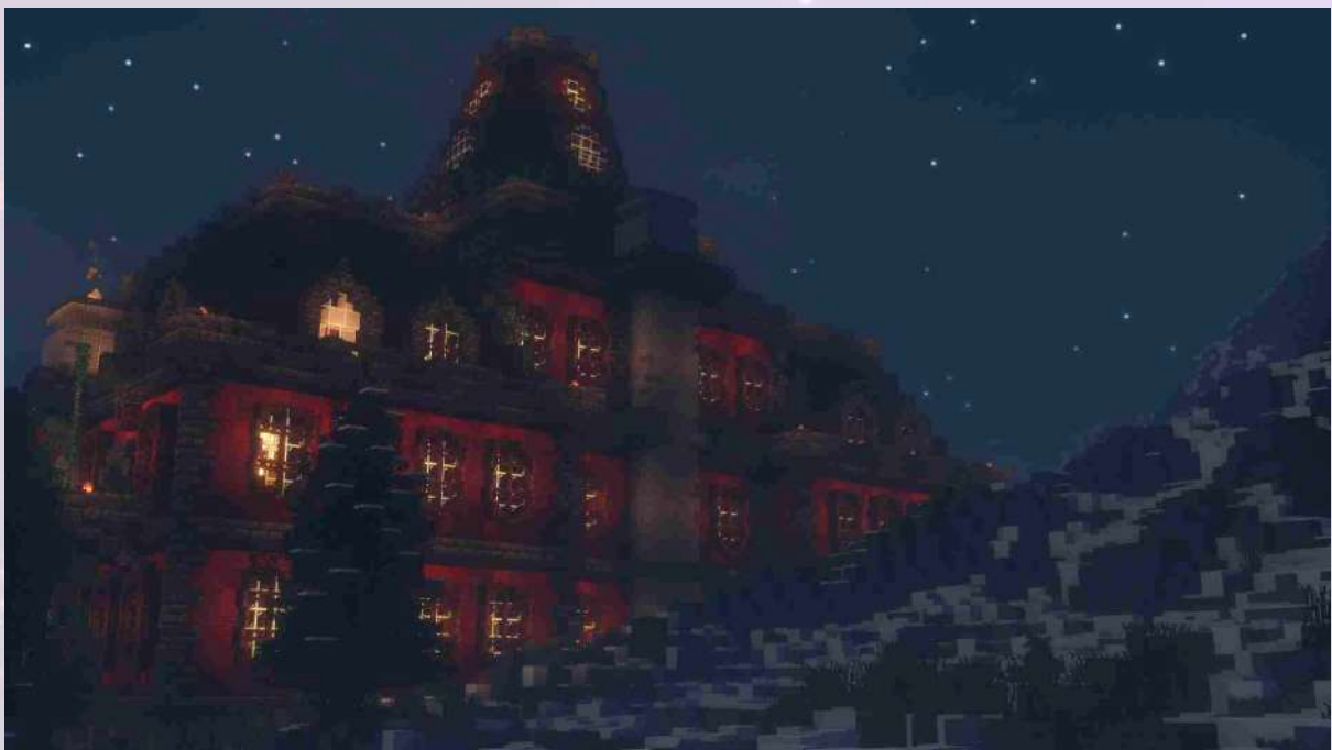
Picture 6: This is roughly the location where I wanted an outside area.

As I said, I never really started work on this but it would have been somewhere behind the mansion next to the tall chimney (Picture 6). Unfortunately, by the time I finished most other rooms, an outside area was simply just forgotten about. I suppose the most important thing to me was that the mansion had a tight focus. Hopefully I succeeded. You be the judge of that.