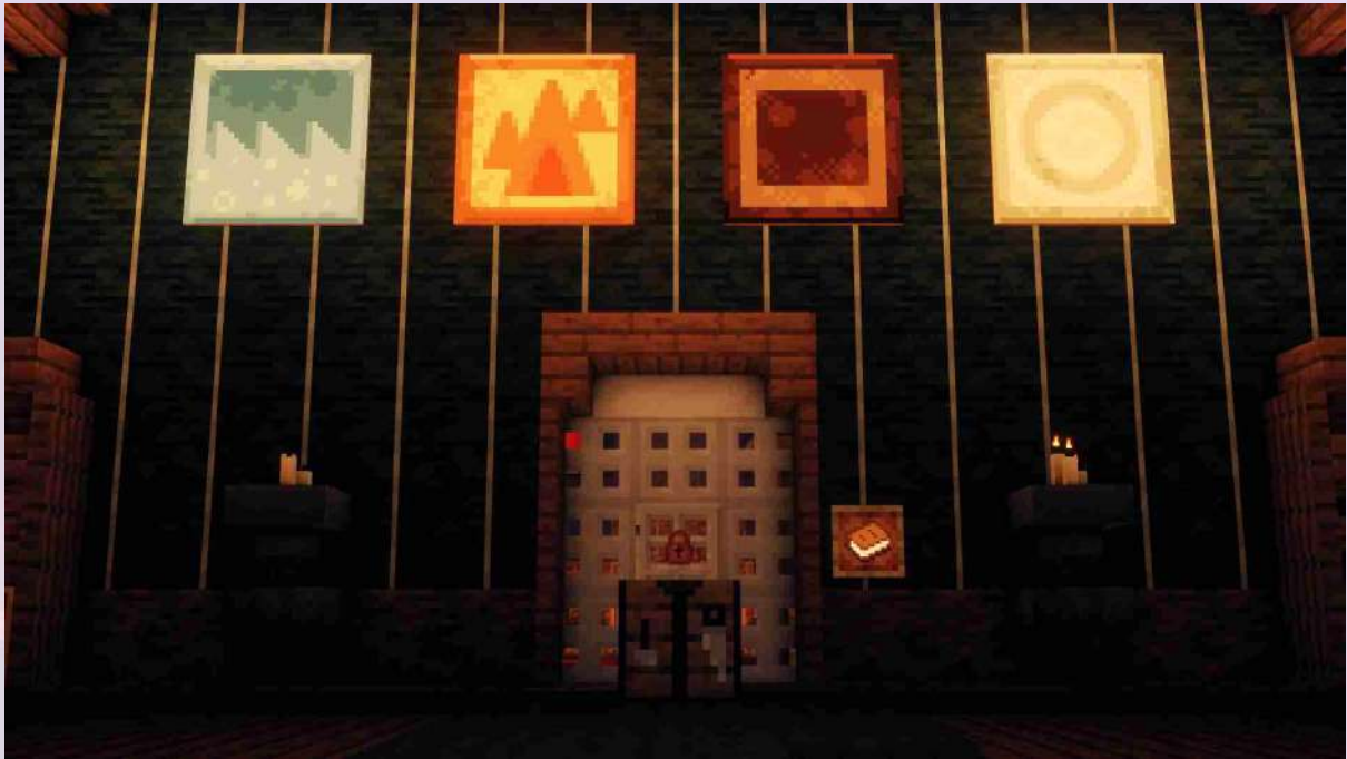
Picture 3: This is the Library door and how the painting puzzle would look like.

It really was a shame to cut it so early on. But it was such a massive barrier for me when I tried to design the map. Perhaps this feature could return one day. At least I hope so.