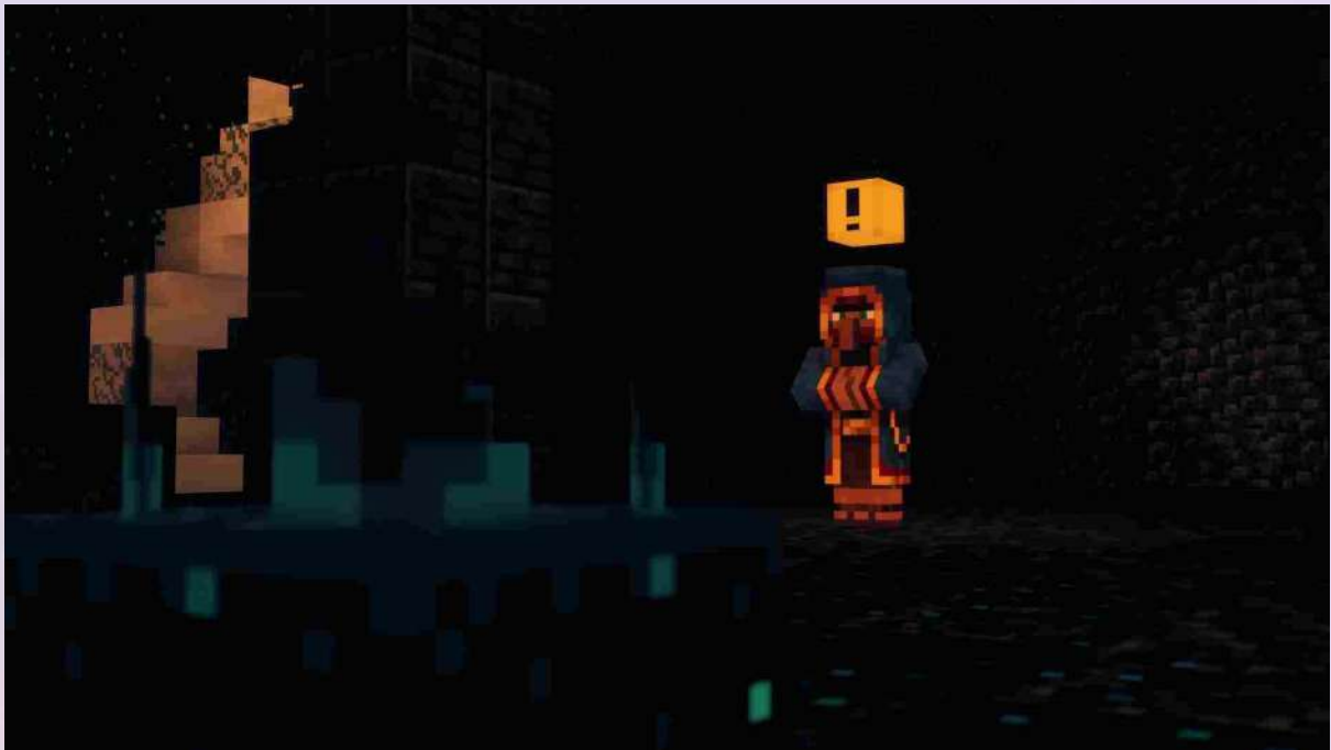
Picture 9: Example: The wandering trader would have warned you of an incoming threat.