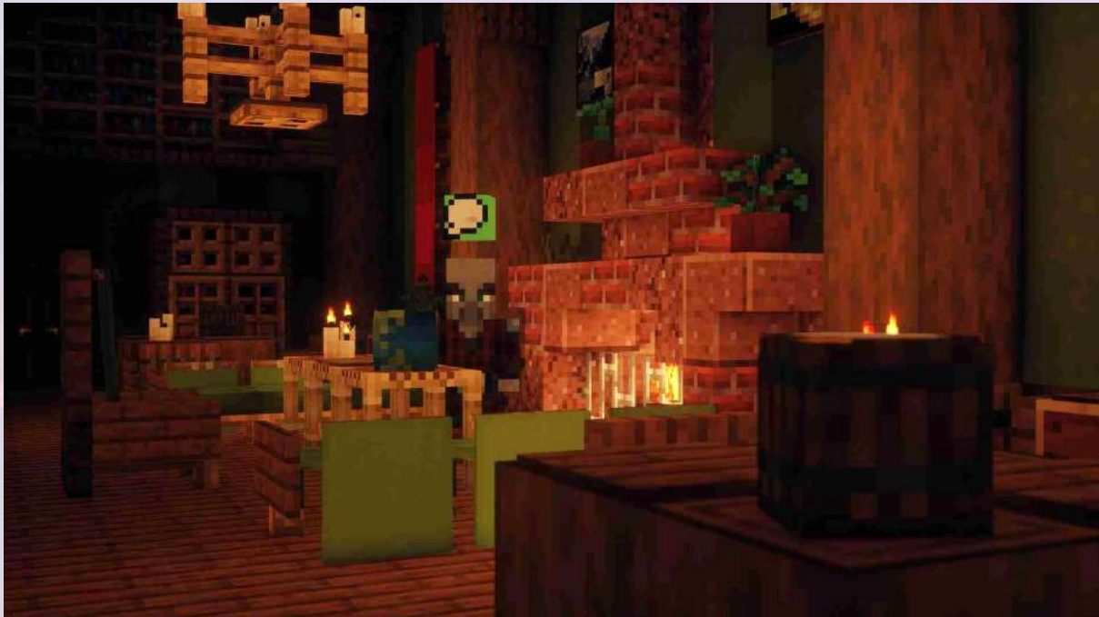
Picture 7: Old Pillager, a slimy, double-crossing, no-good swindler.

Therefore, the items he previously held were then put into other rooms and secret containers. Ultimately the gameplay experience I wanted felt a lot cleaner and streamlined due to the change.