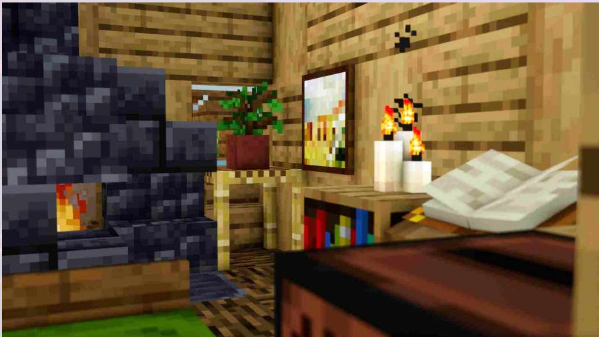
Picture 1: This was the flower pot where the workshop key was hidden.

Thus, to avoid this issue the feature was sadly scrapped.